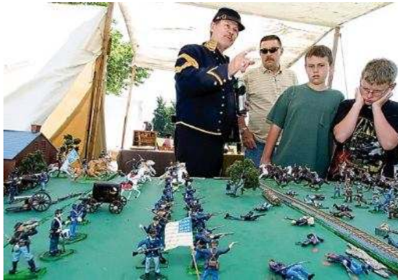
Click here to enlarge this photo