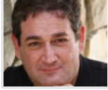
Spiritual Life Examiner