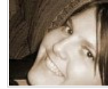
LDS Church Examiner