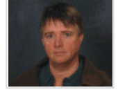
Paranormal Investigations Examiner