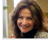
Inner Peace Examiner